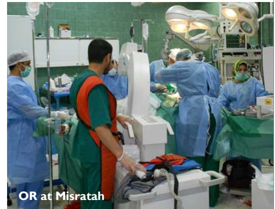
OR at Misratah

After two weeks of hard work with the other volunteer surgeons, I headed back to Canada. We managed to evacuate about fifty victims (including ten ventilated patients) on our ship so their care could continue in a safer environment. I always thought I understood the word 'hero' but after seeing what these young, uneducated fighters have sacrificed to defend their country, I learned a new meaning for the term. These revolutionists don't see themselves as heroes, but as citizens performing a privilege for their country.