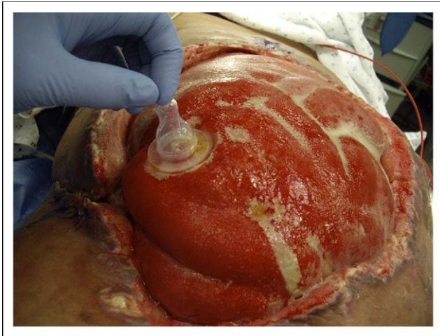
Figure 1 Baby nipple coverage of fistula in a chronically frozen abdomen.

inflated balloon can be connected (Fig. 2). The catheter is properly positioned in the apex of the nipple so as not to contact the bowel or fistula orifice directly (Fig. 3). A nonadherent, petroleum jelly-impregnated gauze or clear Telfa sheet (Tyco Healthcare, Mansfield, MA) is then placed over the bowel excluding the area that the nipple covers in the region of the fistula. Finally, an abdominal wound vac (Wound Vac; KCI, Corp., San Antonio, TX) sponge is tailored to fit over the petroleum dressing covering the exposed bowel. We do not advocate direct contact of the sponge with the exposed bowel because of concerns for additional fistula development.