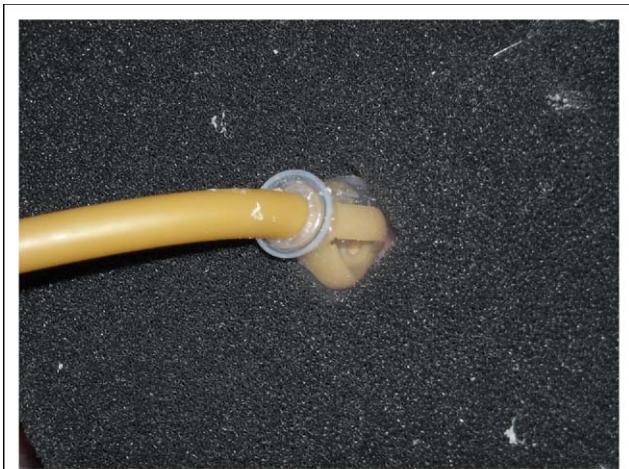
Figure 2 Connection of gravity drainage to the nipple using Malecot drain through the superficial side of the sponge.

During final positioning, a small hole is cut in an appropriate location to accommodate the nipple/catheter apparatus. If an appropriately sized orifice has been cut, one should be able to obtain a seal around and onto the nipple itself. If necessary, however, the plastic covering the sponge can be extended onto the catheter itself to ensure an adequate seal for subsequent vacuum. Particular care should be taken